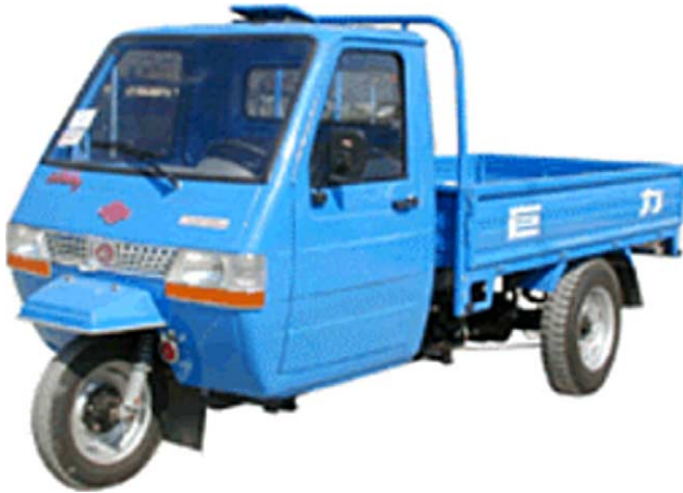
Fig. 2. Typical 3-w CRV.

much as $5,400. Most 4-w CRVs share the following characteristics (see Fig. 3):