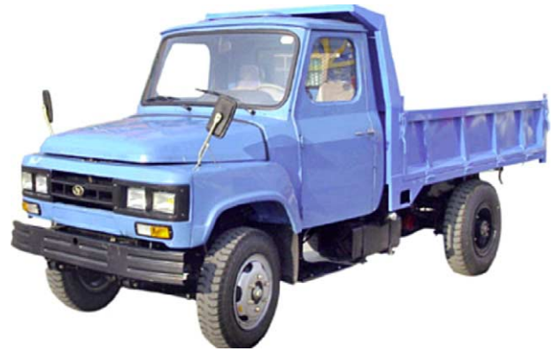
Fig. 5. Shifeng 130T transformed tractor.

There is no standard definition of a transformed tractor. They came about as a response to the increasingly stringent regulation of CRVs emissions, safety, and licensing. As can be seen from the photos in Fig. 5, so-called transformed tractors are like small trucks. They are more sophisticated than most CRVs, though they tend to have slightly lower top speeds and greater towing capability than light trucks, making them more adaptable to rough roads. They vary in price from about 12,000 to 22,000 RMB (US$1450–2600).