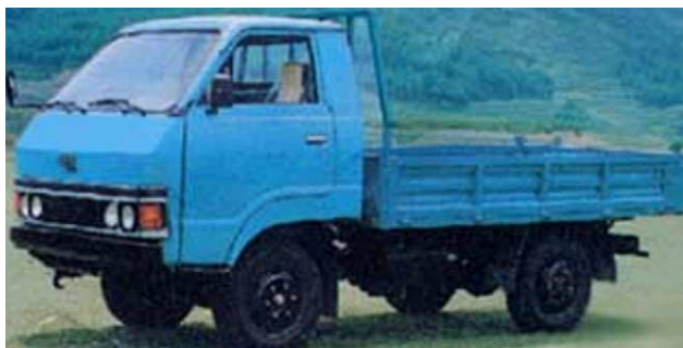
Fig. 3. Sophisticated 4-w CRV.

The CRV industry is highly competitive—but competition has been more on price than quality. In a 2002 survey of CRV product quality conducted by the central government (General Administration of Quality Supervision, Inspection and Quarantine), less than 70% of all CRVs achieved the minimum standard, and only 11.8% of ‘transformed tractors’ (a special category of small 4-w CRVs described later). In Henan province, none of the CRVs met the minimum quality standard. In contrast, a survey of automobiles conducted by the same governmental