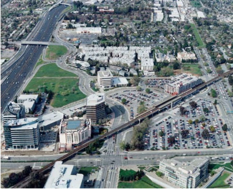
Figure 5-1. Pleasant Hill BART Station and Surroundings

This station is located in Contra Costa County and is surrounded by the communities of Pleasant Hill, Concord, and Walnut Creek, which allows for the investigation of the devices in different jurisdictions. There is limited bus and shuttle service in the area, and the devices could serve as an efficient feeder service from BART to the offices.