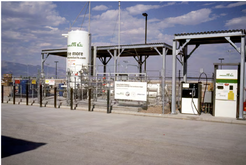
Figure 5: The Las Vegas hydrogen energy station.

The station has reportedly experienced problems with its fuel cell system, and it is at present using hydrogen that is being delivered from an industrial hydrogen production facility rather than produced onsite. Figure 5 presents a picture of the Las Vegas station.