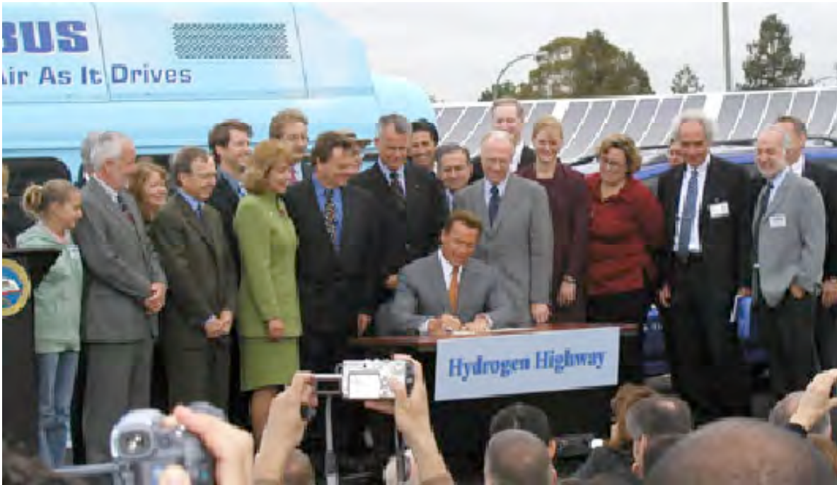
Figure 1: Governor Schwarzenegger signing Executive Order S-7-04 at UC Davis.

In support of the California Zero Emission Vehicle (ZEV) mandate goals to introduce low- and zero-emission vehicles in California, Governor Schwarzenegger announced his intent to create a “California Hydrogen Highway Network” by signing Executive Order S-7-04 on April 20, 2004. He signed the order at a new hydrogen refueling station at UC Davis, dubbed “Station Number 1” by the California Fuel Cell Partnership (CAFCP) because of its public availability.