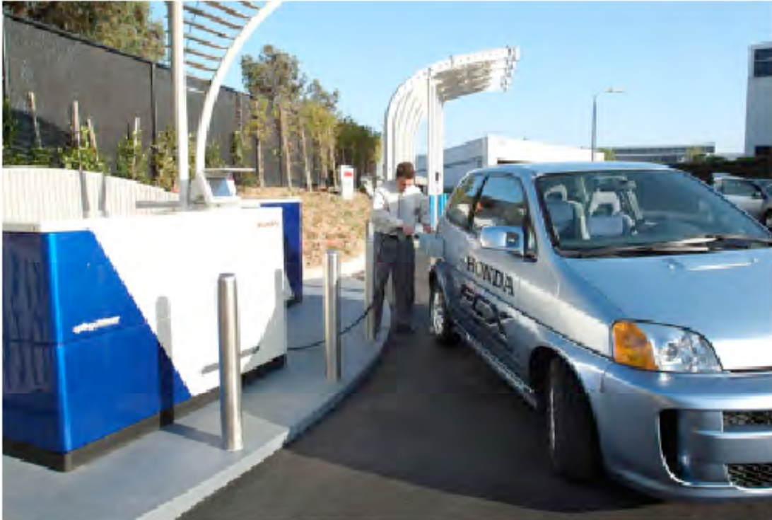
Figure 7: Demonstration of the Honda/Plug Power hydrogen energy station.

Finally, additional hydrogen energy stations have been proposed for Oakland, California (ChevronTexaco and Alameda County Transit), UC Davis (ChevronTexaco and Air Products and Chemicals), and Chino, California (ChevronTexaco and United Technologies Fuel Cells). A more refined energy station design by ChevronTexaco, proposed for the above projects, is presented in Figure 8.