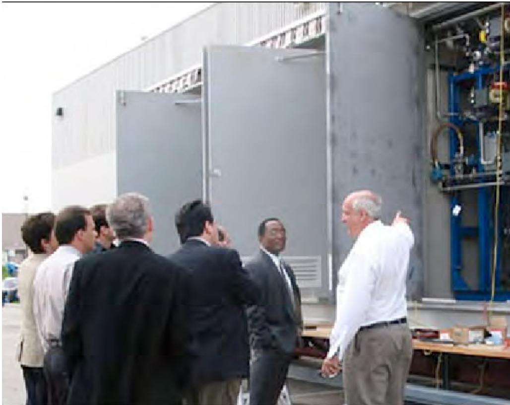
Figure 6: The Toronto hydrogen energy station.

The world's second hydrogen energy station was installed in Toronto, Canada and unveiled at the city's Exhibition Place during the annual 'Green Day' activities at the Canadian National Exhibition on August 27, 2003. The demonstration at the exhibition is the first phase of a three-year initiative undertaken by Hydrogenics, Inc., the City of Toronto, and Exhibition Place. Electrical power generated by a Hydrogenics "HySTAT" fuel cell generator will be used to provide electrical demand "peak shaving" for the National Trade Center during periods of high electricity consumption when power is more expensive. In addition, a John Deere "Pro Gator" demonstrator FCV will be refueled with hydrogen produced by steam reformation of natural gas at the same site, and it will demonstrate the use of fuel cell technology to enhance the productivity and reduce the emissions of work vehicles. In a "Phase 2" in 2004, the system was capable of providing continuous power to the trade center as well as emergency backup power. And in a "Phase 3" of the project, a renewable wind turbine/electrolyzer hydrogen generator will be added to the site, along with a 40-foot, fuel cell-powered passenger bus. Funding support for installation of the fuel cell and vehicle fueling systems was provided by the Canadian Transportation Fuel Cell Alliance and Natural Resources Canada (City of Toronto, 2004). Figure 6, below, presents a picture of the "Phase 1" Toronto station.