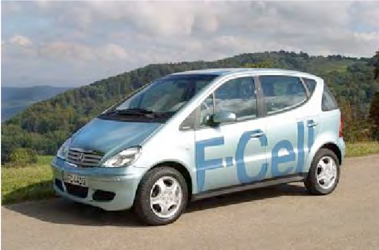
Figure 2: Various agencies and universities are partnering with DaimlerChrysler and the U.S. Department of Energy to experiment with approximately 25 “F-Cell” hydrogen-powered fuel cell vehicles in California, along with vehicles from other major manufacturers.

The vision of the Schwarzenegger Administration for the increased use of hydrogen is noteworthy given the great potential benefits for California, the U.S., and the world in pushing forward with the development of hydrogen fuel for transportation and stationary power production. The initiation of the California Hydrogen Highway Network represents a unique opportunity for the alignment of government, industry, and academia in California to put the State in the forefront of global developments around the use of hydrogen and fuel cells. These efforts, as the Governor has noted, may be important to both environmental and economic vitality in the State. The development of hydrogen technologies faces key technical hurdles, as noted in a recent report by the National Academy of Sciences / National Research Council (NRC, 2004) and hydrogen should be explored along with other options for making transportation systems more clean and efficient, but it is a particularly promising area of research and development (R&D) activities.