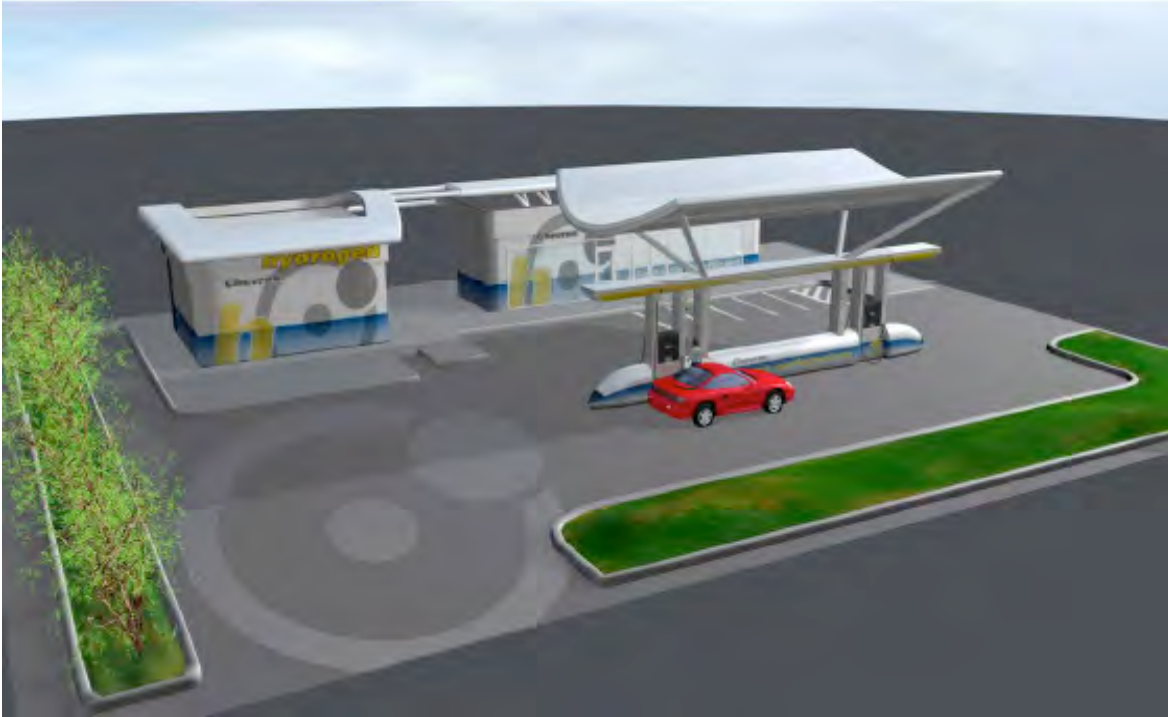
Figure 8: ChevronTexaco hydrogen energy station design, Source: ChevronTexaco Technology Ventures