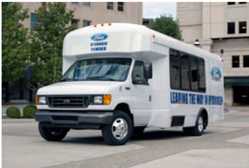
Figure 3: Ford “H2ICE” E-450 hydrogen-powered shuttle bus.

In terms of demonstration and pilot project activities to-date, Florida’s efforts are concentrated in the Orlando area. Five Ford Focus FCVs will be demonstrated in North Orlando with refueling infrastructure provided by BP in a program funded under the U.S. Department of Energy’s “Controlled Hydrogen Fleet and Infrastructure Demonstration and Validation Project” (Barber, 2005). In a second project, eight Ford E-450 shuttle vehicles will be deployed at the Orlando airport starting in 2006. These hydrogen combustion vehicles use a 6.8-liter V-10 battery? and about 26 kilograms of hydrogen, stored at 5,000 pounds per square inch of pressure, to produce a driving range of about 150 miles (McCormick, 2005).