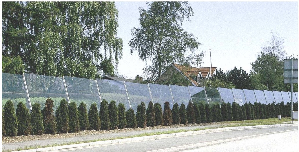
Figure 2.9. 2 m high Transparent noise barrier tilted away from the road in order to reflect the noise upwards to reduce the disturbance of residents on the other side of the road, at National Road 152 in Næstved, Denmark [1].

For low, open housing areas the noise level on the opposite side can theoretically be increased by up to 3 dB due to reflections from a barrier [5, 6]. This is a significant increase as it corresponds to the increased noise level resulting from a doubling of traffic.