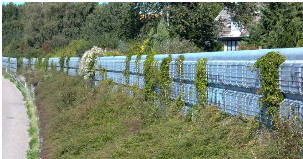
Figure 3.32. Steel noise barrier with steel grid to support vegetation on the barrier at Highway M14 north of Copenhagen, Denmark.