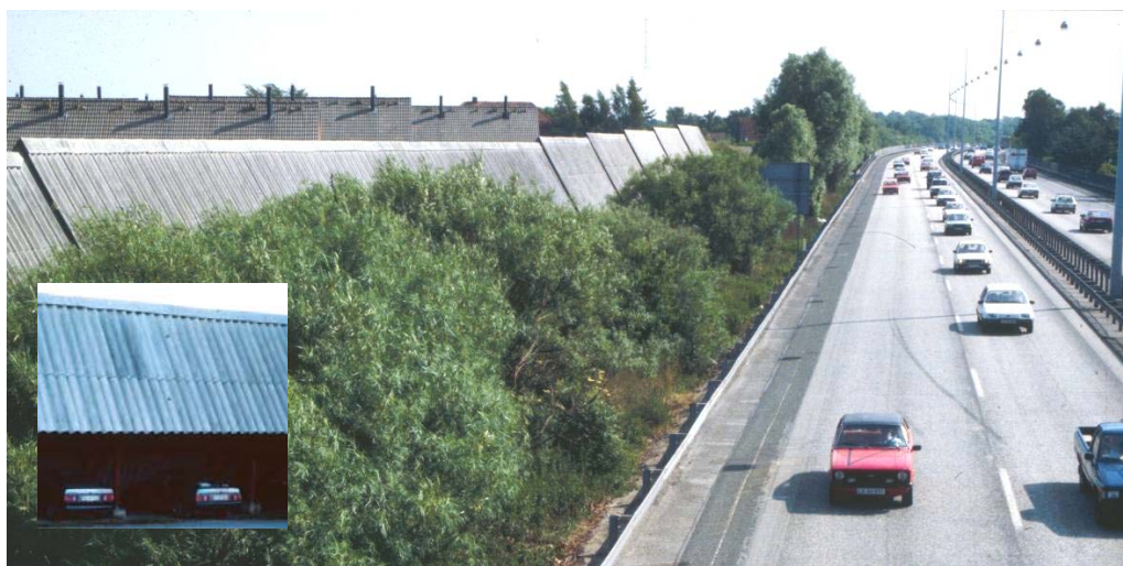
Figure 3.15. The roof of the carport construction for a residential row house area used as a high noise barrier along the M3 ring road around Copenhagen, Denmark [3].