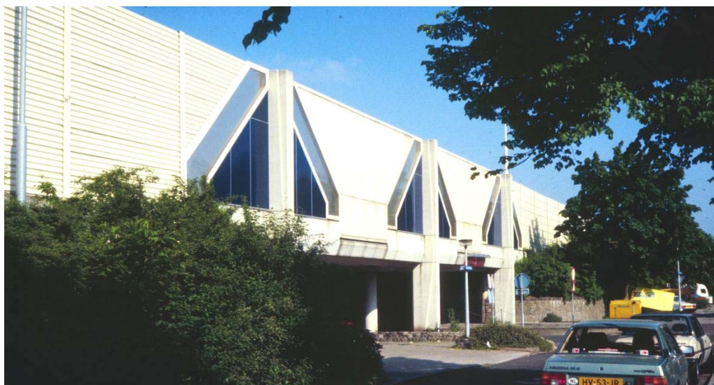
Figure 1.7. 5 m high steel and Plexiglas noise barrier from the Netherlands on a bridge at Highway A9 functioning as a visible addition to its surroundings through a conscious selection of materials, colors and forms [3].

In Chapter 2 some acoustic basics regarding noise barriers are presented. This is followed by Chapter 3 presenting some design guidelines supplemented with many noise barrier examples. The noise levels presented in this report are A-weighted. The unit “dB” is used and it is equal to what is often denoted “dB(A)” and “dBA”.