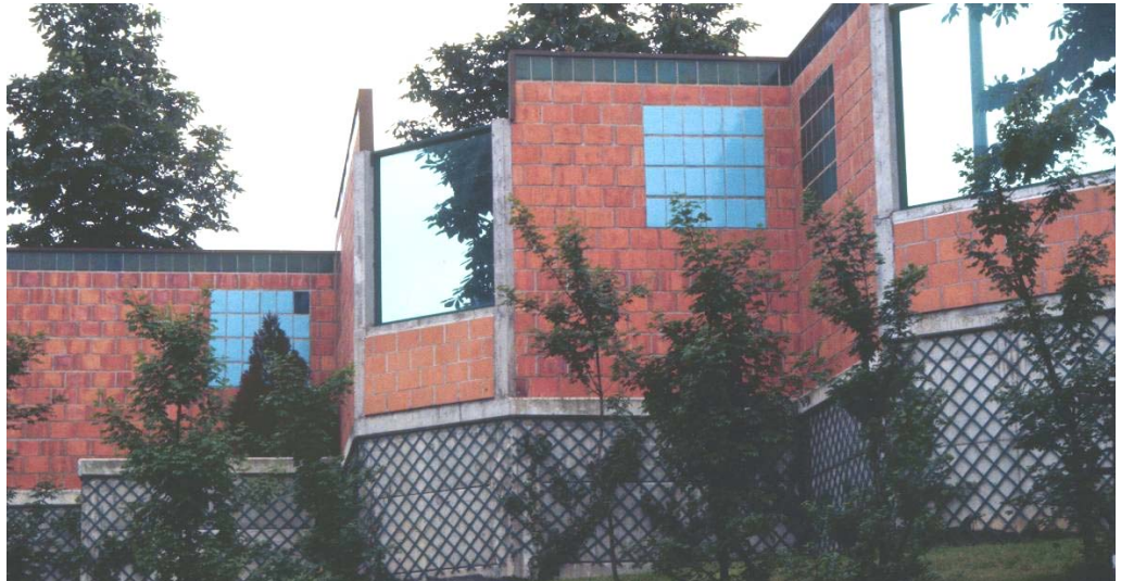
Figure 3.2. Noise barrier constructed of bricks with a lot of details along a highway at an urban residential location in Paris [3].

In both cases, the barrier will have two façades, one towards the road, the other towards neighboring buildings or the adjacent landscape. In an urban environment, the acoustic demands for noise reduction might not be the sole criteria for the height and form of the barrier, as visual criteria may also be of decisive importance for the final decision regarding its height.