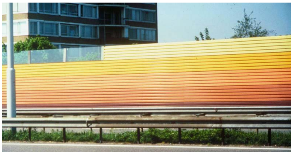
Figure 2.17. 4½ m high colored noise absorbing steel barrier with perforated surface and absorbing material at Highway A9 in the Netherlands [3].