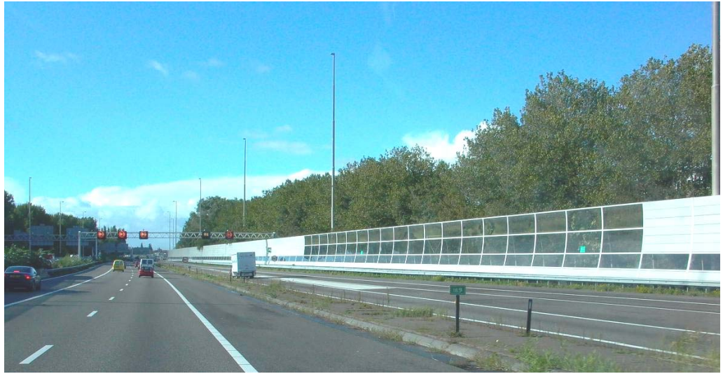
Figure 3.29. Dutch curved steel noise barrier with long transparent section.