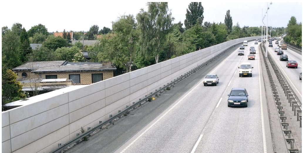
Figure 3.5. Highway side of 3½ m (12 ft) concrete noise barrier in Rødovre along the M3 ring road around Copenhagen, Denmark [1].

Noise screening installations should be constructed so that they make a good visual impression on the different groups of road users who pass by at different speeds. It may be desirable that the side facing a motorway, where road users drive at a speed of 100 km/h (60 mph), should be formed differently from the side facing some building and recreational areas.