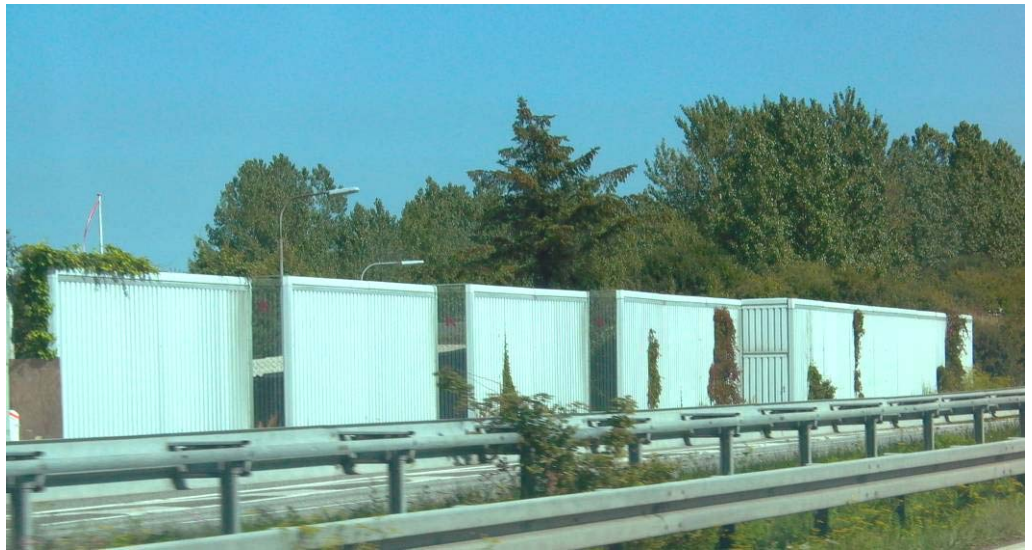
Figure 3.30. PVC barrier with vertical transparent elements along Highway M40 at Nyborg, Denmark.