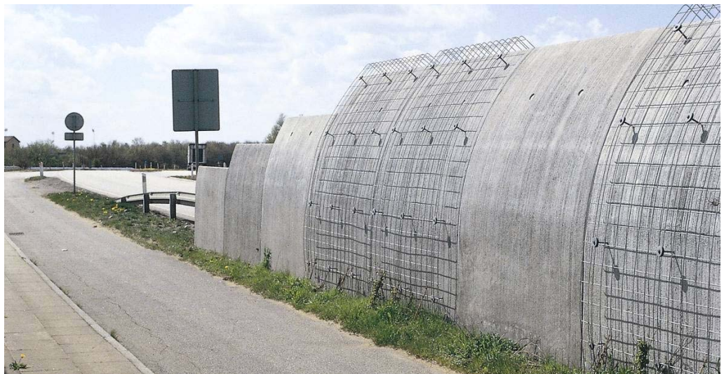
Figure 3.12. Reduced height at the end of a concrete barrier on National Road 411 in Viborg, Denmark [1].

Noise screening installations can be combined with other functions than noise protection, such as solar heating or electricity installations, garages, playgrounds, works of art or sculpture. Similarly, a noise barrier can function as fencing or boundary for a residential area.