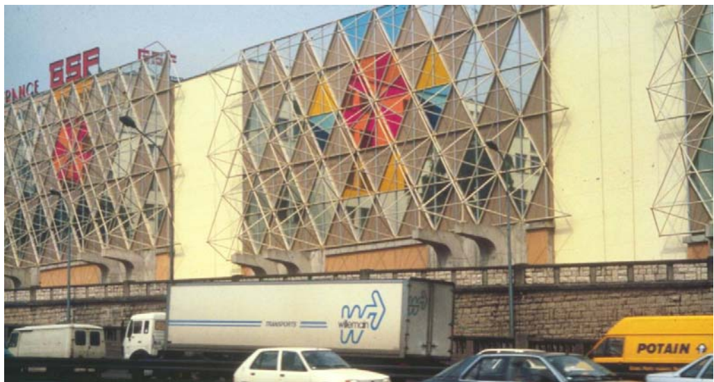
Figure 2.2. 20 m high transparent and colored noise barrier in Paris, France between two 5 story apartment blocks [3].

Acoustically, a tunnel is the most effective way of lowering traffic noise (see Figure 2.1). The covered area can be used as a sports ground or a park. As a noise-reducing installation, a tunnel has many advantages with regard to design, but construction costs are high.