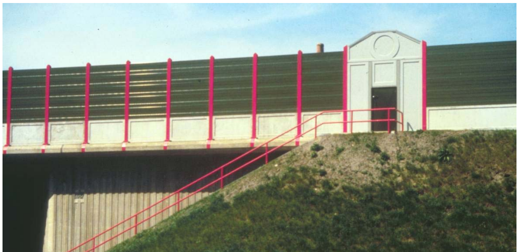
Figure 1.6. 3½ m high dark green steel noise barrier with red steel posts designed using typical building shapes of the surrounding urban environment along a highway south of Hanover, Germany [3].