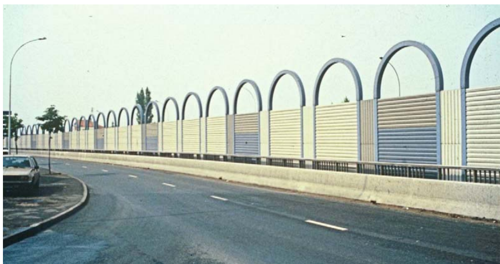
Figure 2.18. 4 m high noise absorbing steel barrier with perforated surface and absorbing material at Highway A6B in Paris, France [3].