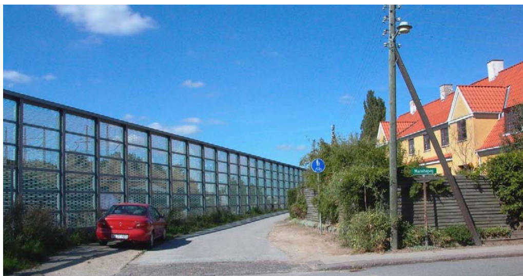
Figure 1.2. Noise barriers have a “back” side facing the nearby town or landscape. Transparent 5 m high noise barrier at Highway M14 north of Copenhagen, Denmark.