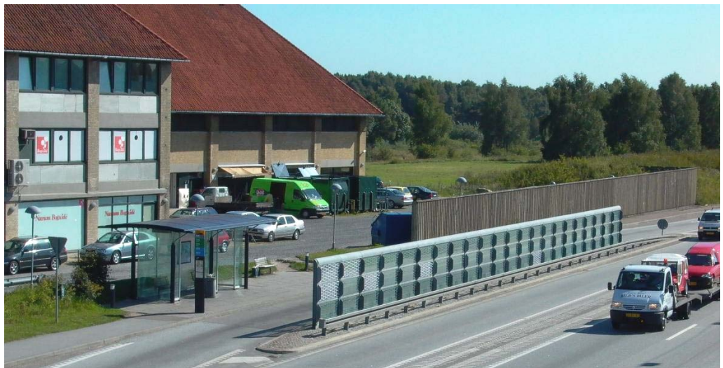
Figure 3.28. Transparent noise barrier in Nærum at bus stop along Highway M14 north of Copenhagen, Denmark.

Acoustically, a tunnel is the most effective way of lowering traffic noise. The covered area can be used as a sports ground or a park. As a noise-reducing installation, a tunnel has many advantages with regard to design, but construction costs are high.