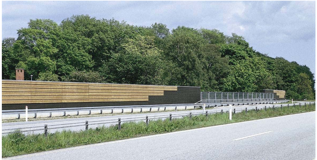
Figure 3.11. Transparent section as part of long wooden noise barrier where Highway M30 passes over a local road in Saksøbing in Denmark [1].