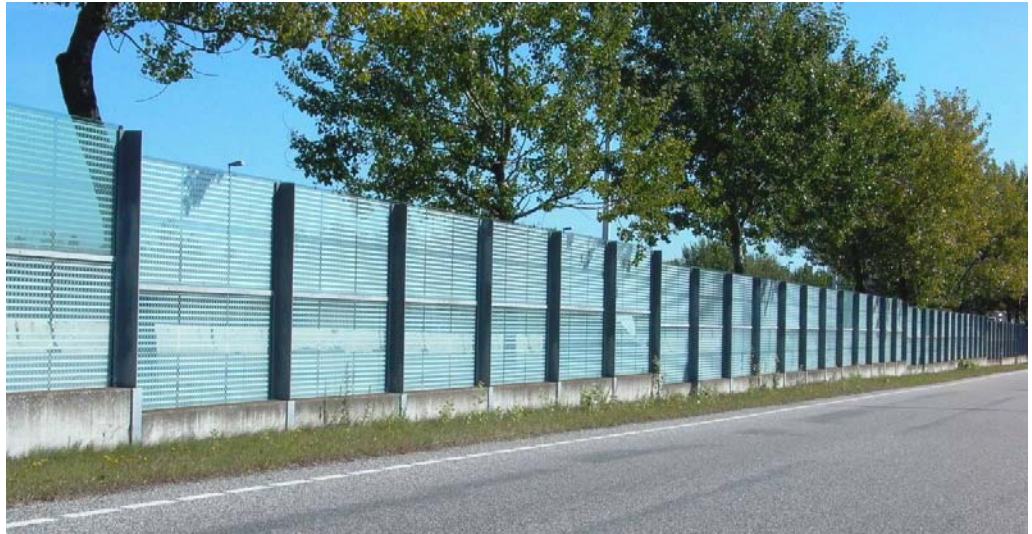
Figure 2.8. 2½ m high transparent noise barrier reflecting noise to the other side of the road along Highway M14 north in Gentofte of Copenhagen, Denmark [1].