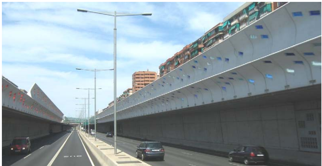
Figure 2.4. Depressed highway partly covered at the road sides and with white concrete noise barriers bending over the highway with colored transparent elements in Barcelona, Spain.

Noise screening normally has a noise reducing effect up to the second or maybe the third level of a building depending on the barrier height and how close to the road it is placed. The effect diminishes if the buildings are higher than that. For buildings of more than two stories, it may thus be necessary to install special noise-insulating windows in order to obtain reasonable noise levels indoors, unless, of course, very high noise barriers have been used. Even in the case of a multi-floored building, noise barriers can be used to reduce noise at outdoor areas (gardens, balconies at ground level etc) and for the lowest floors of the building.