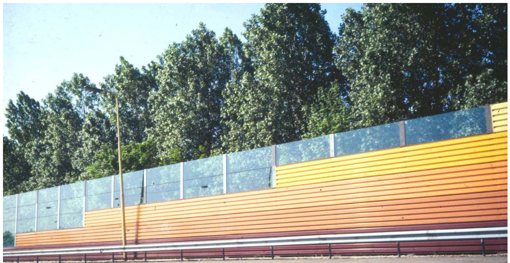
Figure 3.10. 4.5 m (15 ft) high noise barrier with light yellow color at the top and dark red colors below. There is a transparent part and high vegetation behind this barrier at Highway A9 in the Netherlands [3].

The higher a noise screening installation is, and the closer it is situated either to the road or to buildings, the more effective the noise protection will be, but, on the other hand, the more it will dominate the road and its surroundings. A noise screening installation should harmonize with the lines of the road network or with the urban environment in which it is placed. The installation itself should have harmonious lines. Over long distances, however, variation may be important in order to avoid monotony and, thereby, inattentive drivers. The endings of noise screening installations could be marked by special architectural features.