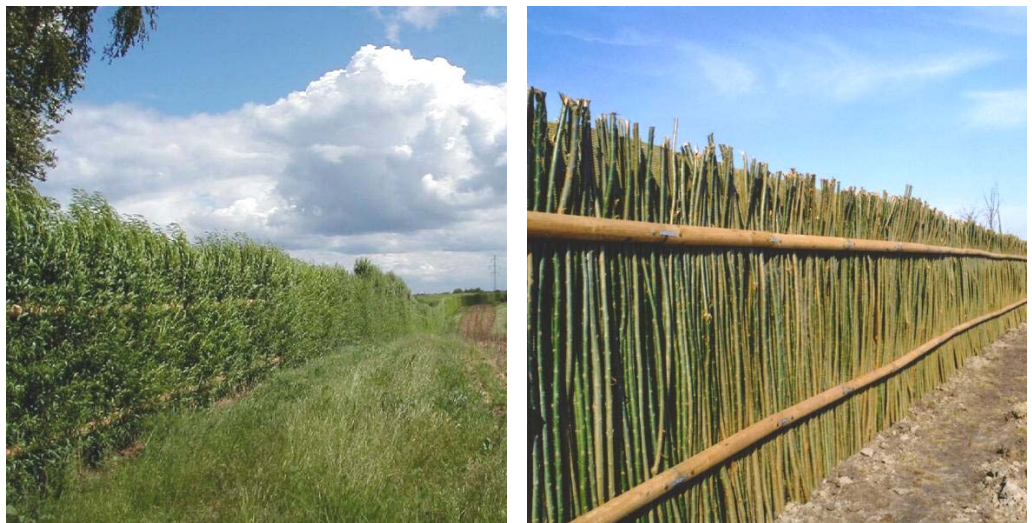
Figure 3.36. Green noise barrier made of panels with willow branches at both sides. When newly constructed to the right and after getting green to the left [2].