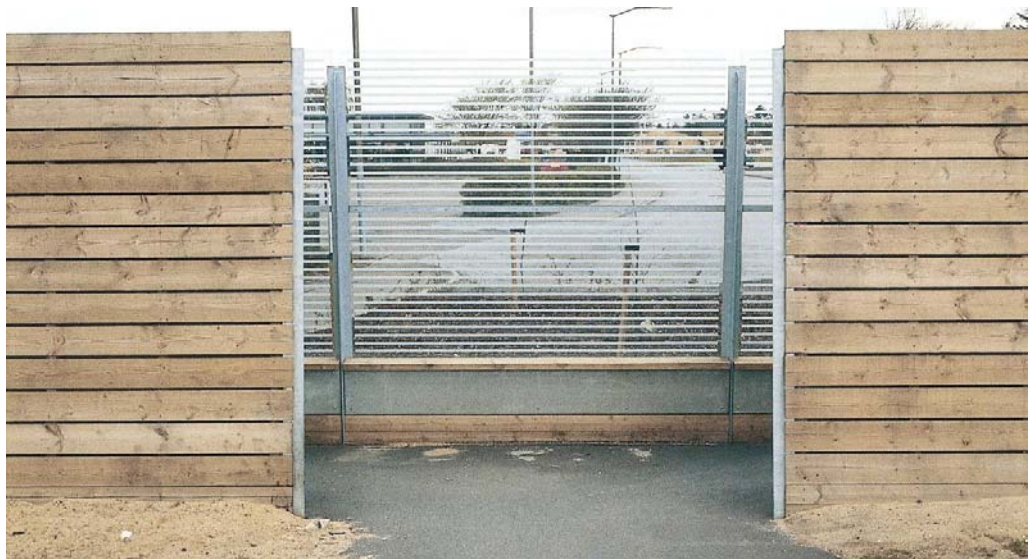
Figure 2.7. 2.5 m high wooden noise barrier in Denmark with passage for pedestrians and bikes at National Road 411 in Skive. A transparent barrier is used behind the wooden barrier to create a noise sluice [1].

The further the receiver is from a noise source, the greater the reduction. This reduction is also dependent on the character of the terrain lying between the source (the road) and the receiver. This form of noise reduction is called terrain reduction, and is an independent factor that is not immediately related to noise screening [6, 7].