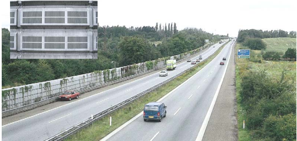
Figure 2.15. 3 to 3½ m high steel noise barrier with absorption elements (see close up to the left) and support for vegetation on Highway M14 north of Copenhagen, Denmark [1].