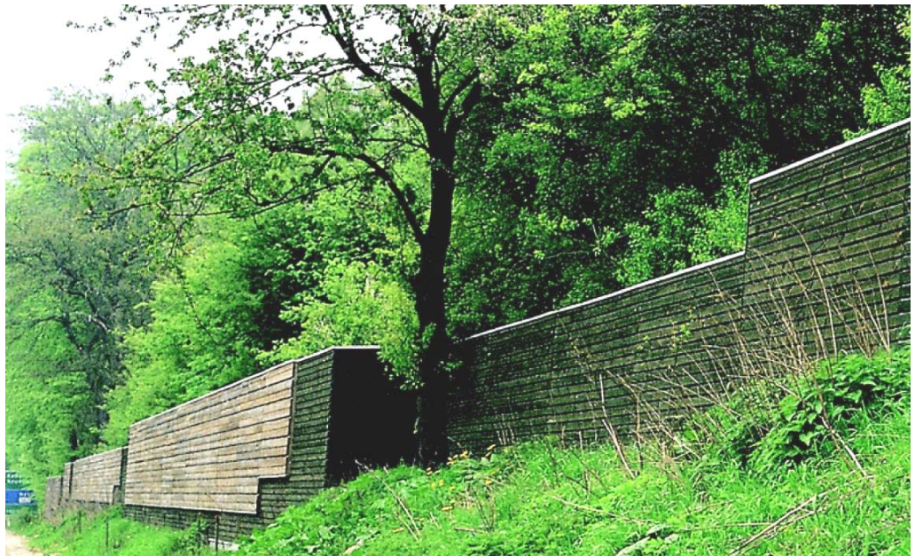
Figure 3.7. 3 m (10 ft) high wood noise barrier along a highway at the countryside adapted to the existing old vegetation at Highway M40 near Nyborg, Denmark [1].

In cases where a noise barrier is to be placed at the countryside, where the buildings are not situated close to the road, the barrier could be adapted to the road, the landscape and to the existing vegetation.