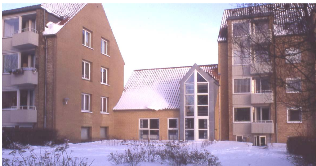
Figure 3.16. Two stories building with laundry and meeting room constructed between two apartment blocks also to function as a noise barrier for the road noise in the hole between the apartment blocks reducing the noise at the outdoor areas in Århus, Denmark.