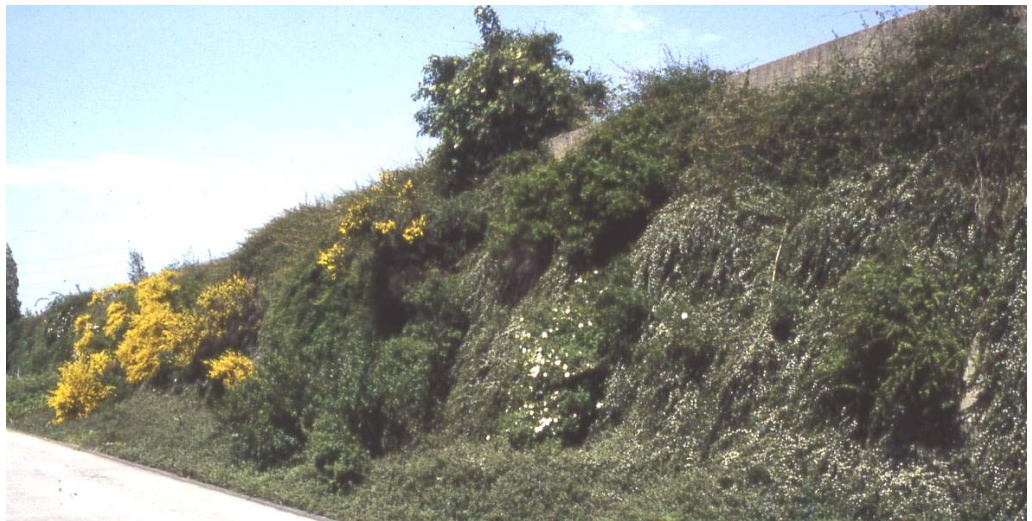
Figure 3.23. 7 m (23 ft.) high supported earth embankment with vegetation along Highway A3 near Cologne, Germany [3].