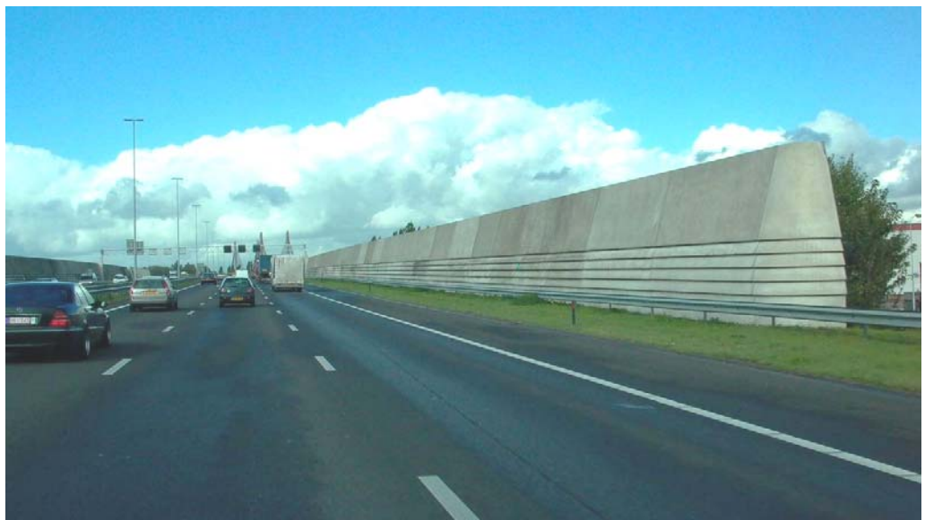
Figure 2.10. Dutch concrete noise barrier bent at a small angle from the road in order to reflect the noise upwards to reduce the disturbance of residents on the other side of the highway.

There are different solutions to reflection problems deriving from noise screening installations. These solutions involve different visual impacts, which can make their mark on the surroundings of the road. The barrier can be erected at a slant so that the noise is reflected up into the air, where it will not disturb anyone (see Figure 2.9 and 2.10). For an earth embankment with sloping sides this will always be the case.