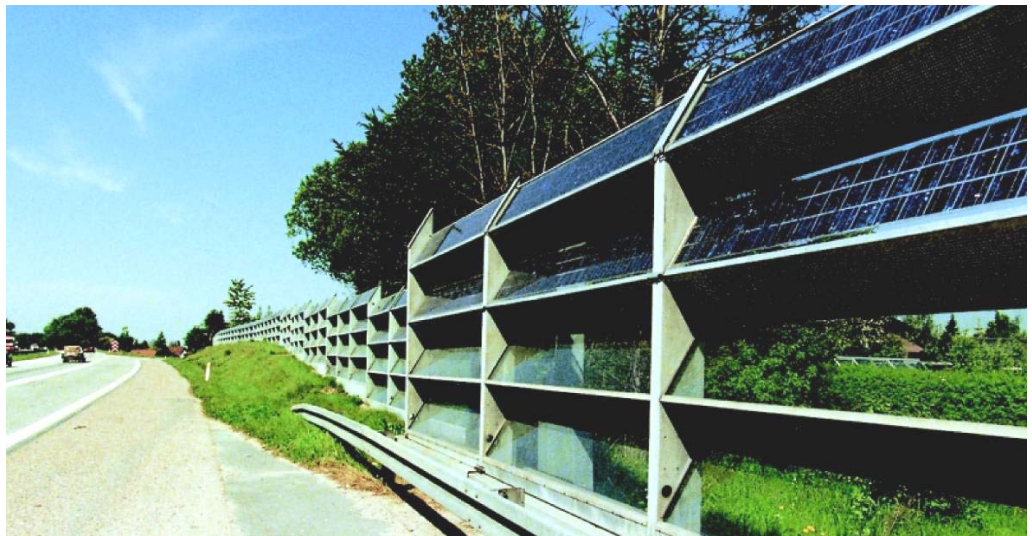
Figure 3.14. Transparent steel noise barrier with electric solar panels at the top. At Highway M11 at Fløng, West of Copenhagen, Denmark [1].