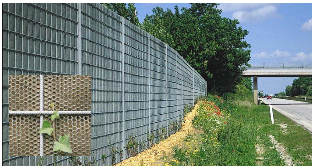
Figure 2.12. Danish absorbing noise barrier made as a steel frame with absorbing mineral wool and a steel grid in front (close up in left corner).