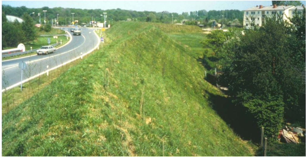
Figure 3.20. Earth embankment as a noise barrier in Germany.

If the desired barrier height is more than 4 to 5m (13-16 ft), it will often be easier to harmonize an earth embankment with the surrounding landscape than a noise barrier. As they require a relatively large amount of space, earth embankments will primarily be used in the countryside and in connection with areas where housing is less dense or scattered. In the course of a few years, a manmade earth embankment with vegetation will appear to blend in with nature. Earth embankments can have the effect of additions to the road environment and can enhance the natural character of the landscape.