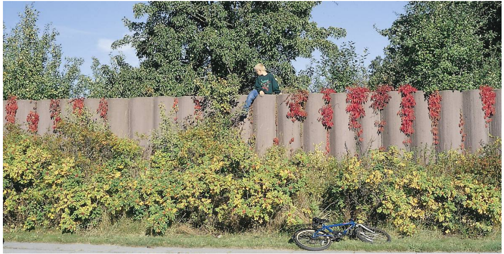
Figure 3.4. Brown concrete noise barrier with details and vegetation adapted to low a speed road in an urban environment in Århus along National Road 405 [1].

Noise screening installations should be constructed so that they make a good visual impression on the different groups of road users who pass by at different speeds. It may be desirable that the side facing a motorway, where road users drive at a speed of 100 km/h (60 mph), should be formed differently from the side facing some building and recreational areas.