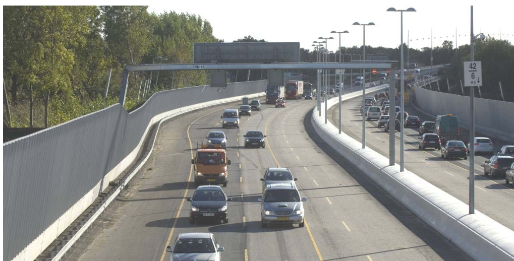
Figure 3.18. 4 m (13 ft) high aluminum absorbing noise barriers bent 10° towards the road along both sides of the M3 ring road around Copenhagen, Denmark.

Noise barriers and embankments should have a robust appearance and harmonize with the character of the road and its surroundings. However, they may also appear as deliberate contrasts to the surrounding in order to enhance weak but characteristic landscape elements. Finally, the barrier can stand out as a unique landmark. Furthermore, it is important to use materials that wear well, so that the appearance of the barrier does not become more and more shabby. A smooth surface will be perceived as being larger than a broken surface. The use of different materials, colors and of vegetation can contribute significantly to breaking the monotony of long and high noise barriers.