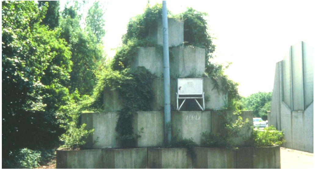
Figure 3.22. Supported earth embankment made of concrete pipes piled on top of each other in triangles and filled with earth along Highway A3 near Cologne in Germany [3].