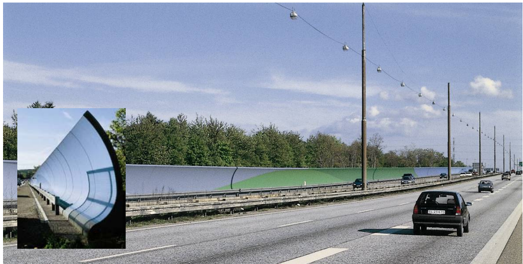
Figure 3.26. 3 m (10 ft) concrete noise barrier constructed in a curved shape and painted along Highway M13 in Gladsaxe north of Copenhagen, Denmark [1].

Concrete can be used to give noise barriers many different shapes. Concrete barriers can be given many different surface structures and they can be constructed with plant boxes, so that they can be combined with vegetation. Concrete can also be colored and thus adapted to the surroundings; for example, a barrier can be colored dark brown, which forms a good background for vegetation. If concrete is treated properly, good results can be achieved, and with its thickness and structure, concrete has qualities that can fit in a well with the road environment.