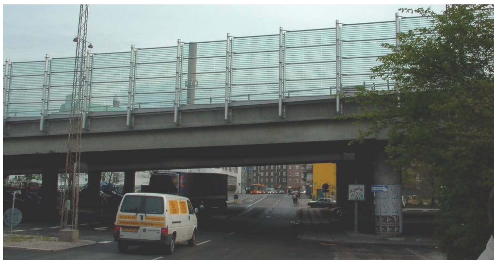
Figure 3.1. Transparent noise barrier designed for use on a highway bridge in an urban environment in Nørrebro, Copenhagen, Denmark.