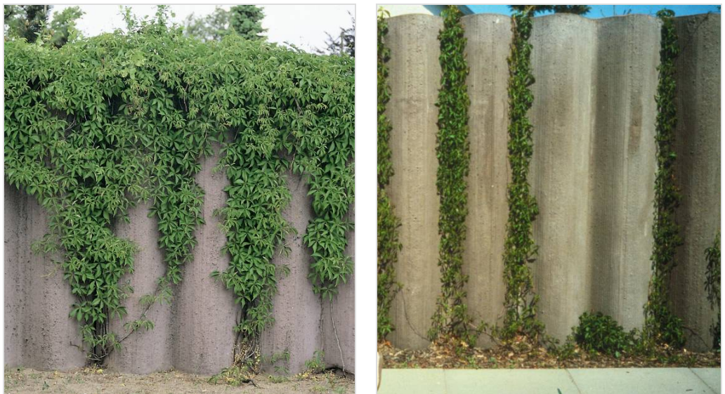
Figure 3.25. Colored concrete noise barrier made of 8 cm (3 in.) thick corrugated element with green vegetation at National Road 405 in Århus, Denmark [1, 3].

If vegetation is planted along a wooden barrier, this can, however cause maintenance problems, as the plants will have to be removed when the barrier is to be painted.