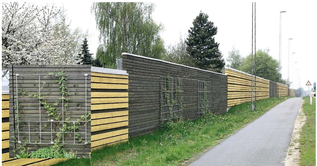
Figure 3.35. Wooden noise barrier with steel net to support vegetation at National Road 310 in Horsens, Denmark (detail to the left).