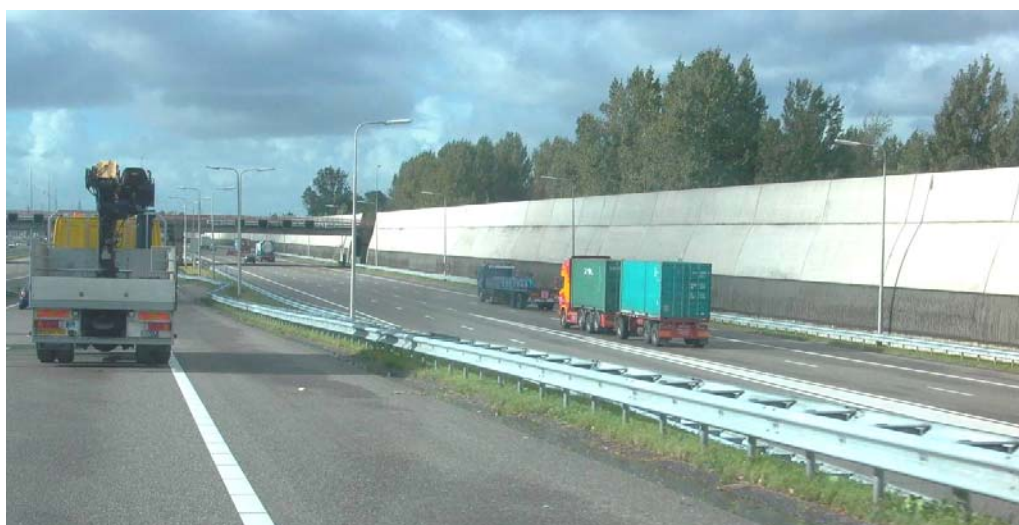
Figure 1.3. Noise barriers can be large structures which have an impact on the local physical environment. Shaped gray and white concrete barrier at a highway in the Netherlands.

Noise barriers and noise embankments are often relatively large and conspicuous structures which may not fit in with the surrounding environment. When a noise barrier has been erected, it represents a considerable economic investment and can be expected to remain standing for several decades. The people who live in the neighborhood of a noise barrier will have to look at the structure every day. This is also true for pedestrians, cyclists or motorists who daily pass a noise barrier. A noise barrier or noise embankment could therefore be regarded as a structure that has two facades, one facing the road and one the nearby town or landscape.