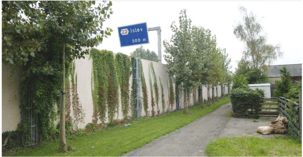
Figure 3.6. The residential side of a concrete noise barrier with vegetation along a high speed highway in Copenhagen, Denmark [2].

In cases where a noise barrier is to be placed at the countryside, where the buildings are not situated close to the road, the barrier could be adapted to the road, the landscape and to the existing vegetation.