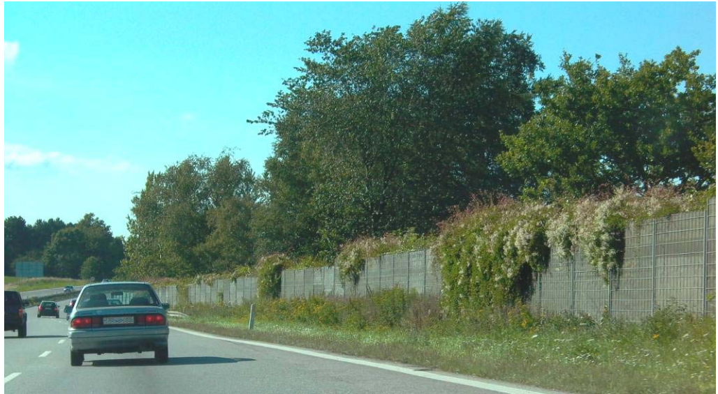
Figure 2.13. Absorbing noise barrier with vegetation at Highway M14 north of Copenhagen, Denmark.

Finally, there is a third solution, in which a noise barrier is provided with sound absorbent material on the side facing the road, so that reflection is reduced or entirely eliminated (see Figure 2.12 to 2.15).