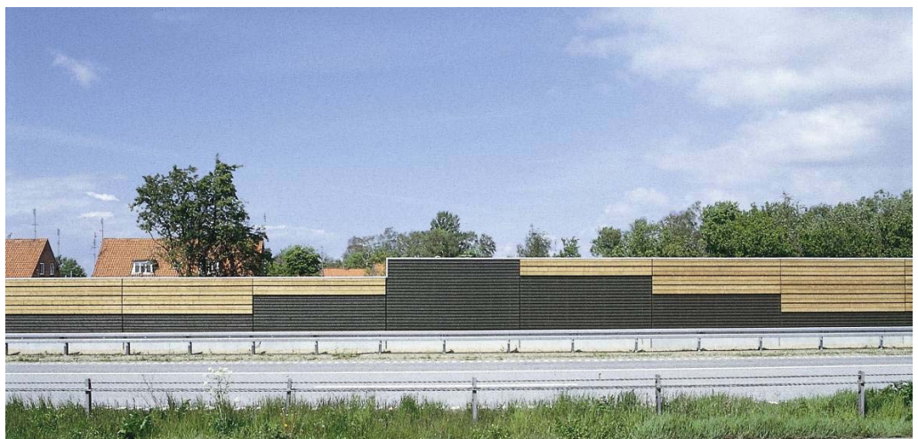
Figure 3.3. 2 to 3 m (6 to 10 ft) high wooden noise barrier at Highway M30 in Saksøbing in Denmark [1].

Noise screening constructions are seen by different groups of road users and residents who pass the installation at very different speeds. Residents living near a noise screening installation have a direct and constant view of it from their windows, from outdoor activity areas and approach roads. Pedestrians and cyclists pass the installation at low speeds and therefore have times to perceive details of form and colors.