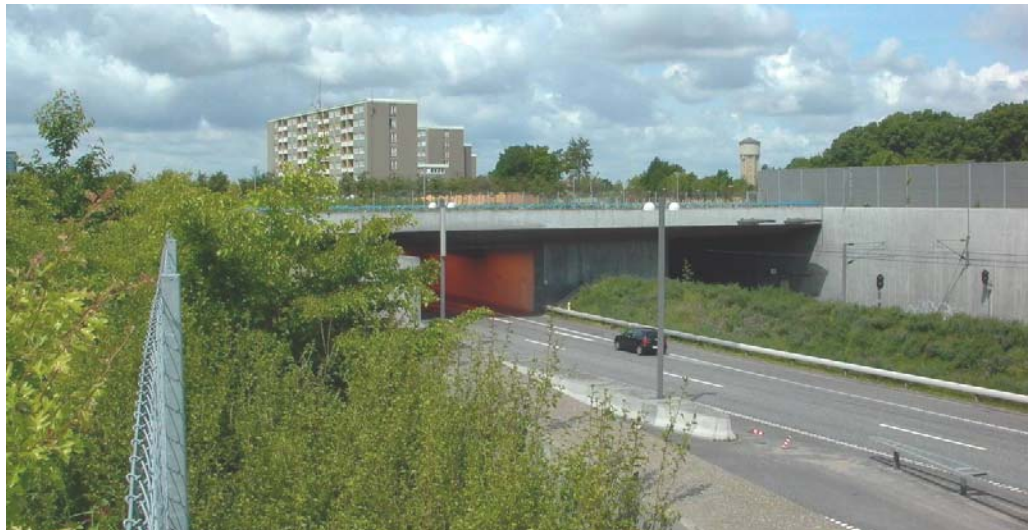
Figure 2.1. 700m long concrete cover over a new highway alignment to Copenhagen Airport through a preexisting residential area with apartments. The cut-and-cover strategy used here solved two problems; reducing traffic noise levels and keeping the new roadway from dividing the community. The covering has been planted and established as a green recreational area.