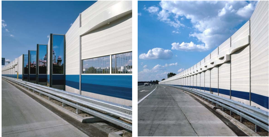
Figure 3.31. Steel and transparent noise barrier along highway in Vienna, Austria.

It is important that noise barriers are kept clean and in a good state of repair, as neglected or soiled barriers are very liable to give the road and its surroundings a shabby and decaying appearance. Graffiti can be a problem in relation to noise barriers. Effective methods for removal are available. Vegetation and difficult access to barriers reduces the risk for graffiti. Transparent barriers can at some locations increase the risk of vandalism. Artificial transparent materials (eg. acrylic or polycarbonate) are normally more resistant to vandalism than glass barriers. In planning a new noise screening installation, ongoing maintenance and cleaning of the structure should be considered.