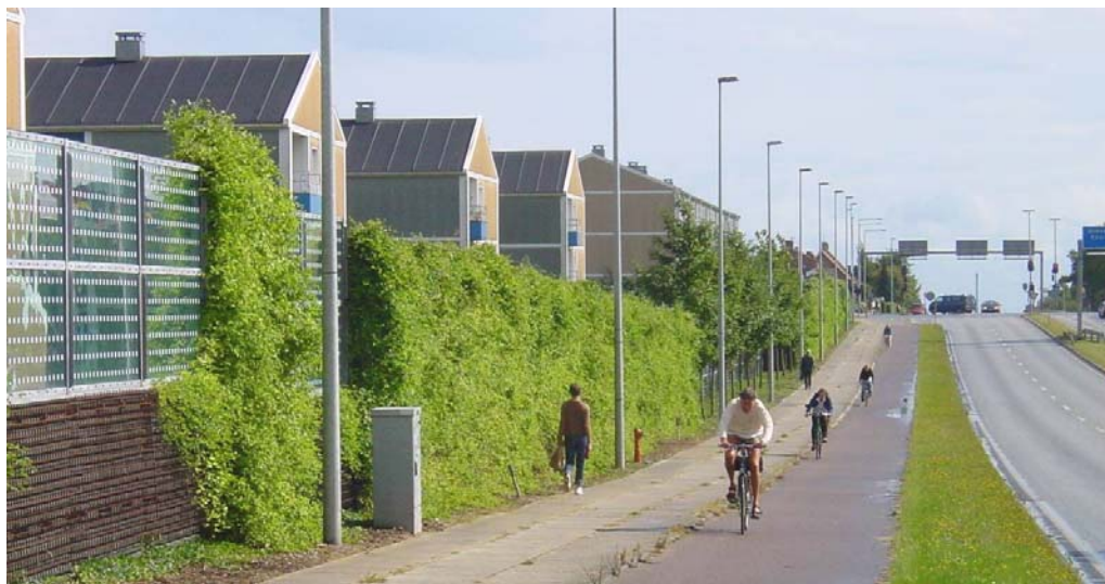
Figure 2.11. Danish transparent noise barrier with vegetation that can reduce the noise reflection.