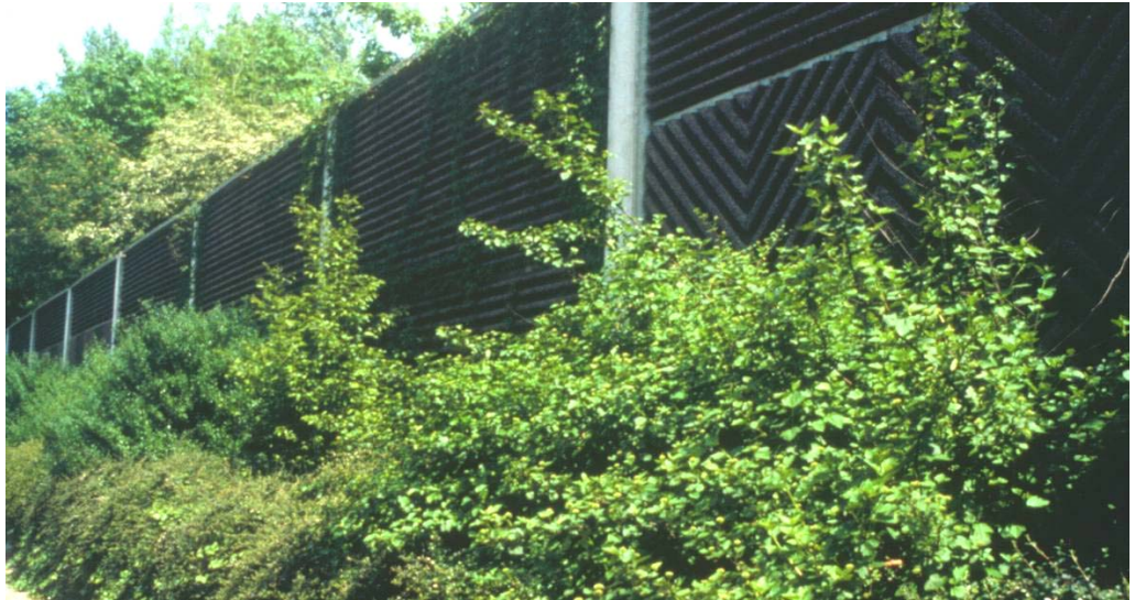
Figure 1.5. 4 m high profile brown concrete noise barriers with 1 m high plant box for vegetation along Highway A4 southeast of Cologne, Germany [3].