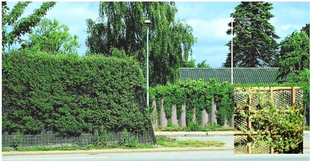
Figure 3.21. A supported 3 m (10 ft) high earth embankment with a slanting steel net to the left (details to the right) at National Road 405 in Aarhus, Denmark [3].

A supported earth embankment can be constructed in a number of fundamentally different ways. One type is the so-called growth barrier in Aarhus, Denmark (see Figure 3.21), where the earth is supported by a slanting steel frame of 12 mm (1/2 in.) round steel with 10 cm (4 in.) openings and plastic netting with 6-7 mm (1/4 in.) meshes [3]. The barrier has an irrigation system in the top. This kind of noise barrier can be used where there is not enough room for an earth embankment, but where a green barrier with a natural appearance is desired. In the course of a few years and with good growth conditions, a supported earth embankment will appear as a green hedge in the summer period and will as such merge well with a suburban environment, where green hedges are common.