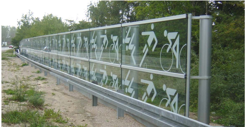
Figure 3.27. Transparent noise barrier with a "bike print" along a highway in an urban district in Denmark [2].