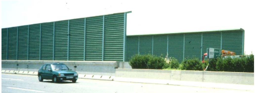
Figure 2.5. High noise barriers placed both at the side of a highway and at the center of the highway in order to increase the noise reducing effect at a highway in Italy.

In areas close to the end of the noise barrier its effect diminishes because the sound propagates around the end of the barrier. Therefore, the barrier should be continued some way past the noise-sensitive area or be concluded by a curve along the border of the area, away from the road.