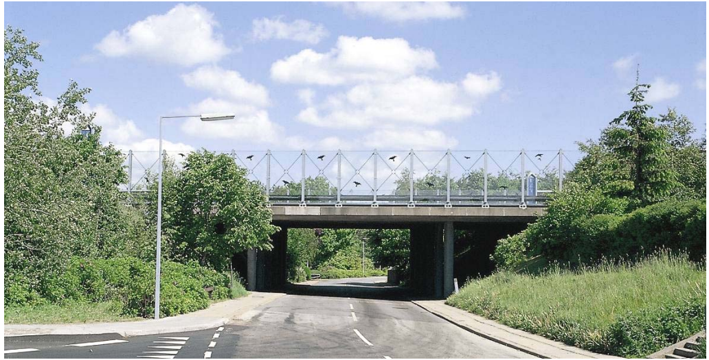
Figure 3.8. Transparent noise barrier used where Highway M70 crosses a local road in Ålborg, Denmark [1]. This allows the drivers on the highway to get a sight of the surrounding landscape.

The height of a noise screening installation is also important for road users and their possibilities of orientation in the urban area or landscape through which they are passing. Even the erection of a 1.5 m (5 ft) high barrier affects visibility conditions for motorists. They will, however, still have a certain overview of the town or landscape. With a barrier that is 3 m (10 ft) high, it is only possible to see the highest elements in the surroundings, such as multi-storey buildings, water towers, church towers or hilltops, which typically function as landmarks. A barrier of 5 m (16 ft) will, however, cut off practically all view of the surroundings. In such cases, high consideration must be taken of the form, colors and materials of the noise screening in order to ensure that motorists have an acceptable road space to look at.