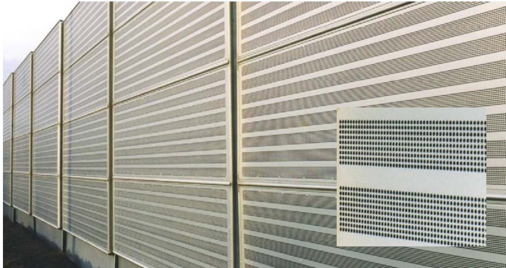
Figure 2.14. Noise absorbing steel barrier with perforated surface and absorbing material at a highway in Denmark (close up to the right) [2].

Finally, there is a third solution, in which a noise barrier is provided with sound absorbent material on the side facing the road, so that reflection is reduced or entirely eliminated (see Figure 2.12 to 2.15).