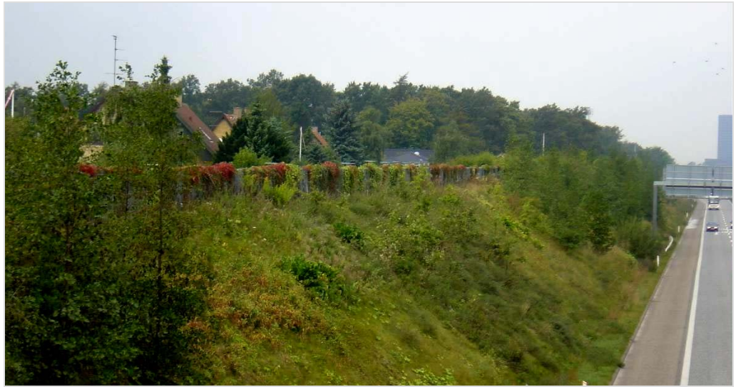
Figure 3.24. Noise barrier with vegetation on top of earth embankment in Denmark [2].