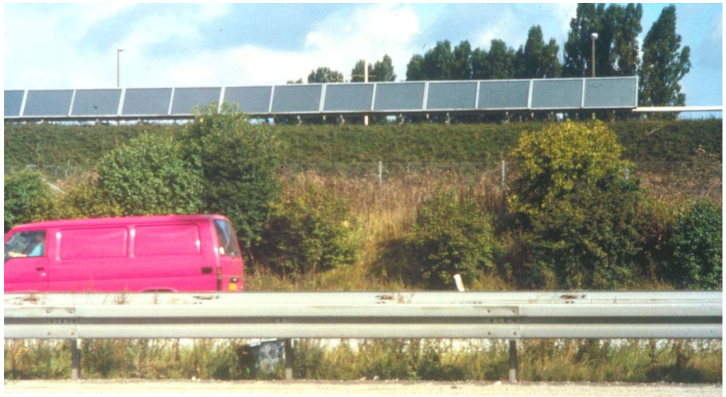
Figure 3.13. Earth embankment with solar panels on the top in Copenhagen, Denmark [3].