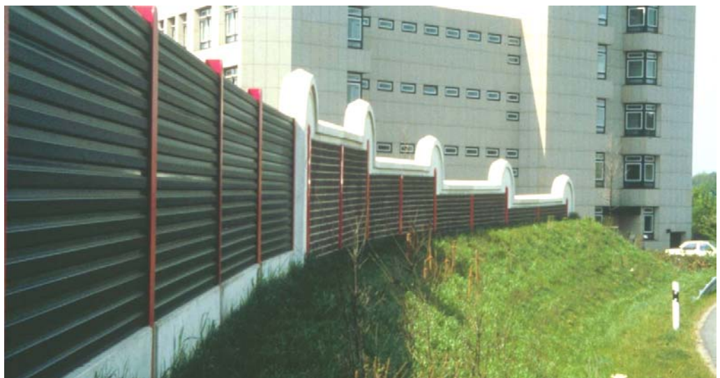
Figure 2.6. Noise barrier with reduced height at the end in Hanover, Germany [3].

In areas close to the end of the noise barrier its effect diminishes because the sound propagates around the end of the barrier. Therefore, the barrier should be continued some way past the noise-sensitive area or be concluded by a curve along the border of the area, away from the road.