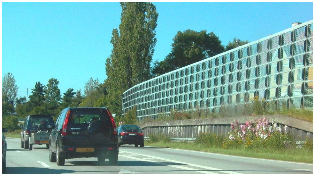
Figure 1.1. Noise barriers have a “front” side facing the highway. Transparent 5 m high noise barrier at a 1½ m high embankment at Highway M14 north of Copenhagen, Denmark.

Along existing roads and highways as well as in places where it will not be possible to reduce nuisance from noise through planning measures within the foreseeable future, it may be necessary instead to establish noise screening in the form of noise barriers or embankments. Where homes affected by noise in urban areas are situated close to the road from which the nuisance derives, it will not always be possible to find space for noise screening. In this case, the noise can be reduced through the insulation of the façades of the buildings, for example, by providing special noise reducing windows etc. An additional advantage of noise screening compared to the insulation of façades is that the former also provides a reduction of noise at the outside areas adjacent to the road.