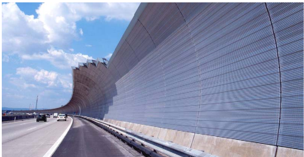
Figure 2.3. Steel noise barrier in Vienna, Austria bending over the highway in order to increase the noise reduction.

The effective barrier height marks the distance between the top of the barrier and a straight line drawn between the receiver and the source of noise. The larger the effective barrier height, the greater the noise-reducing effect.