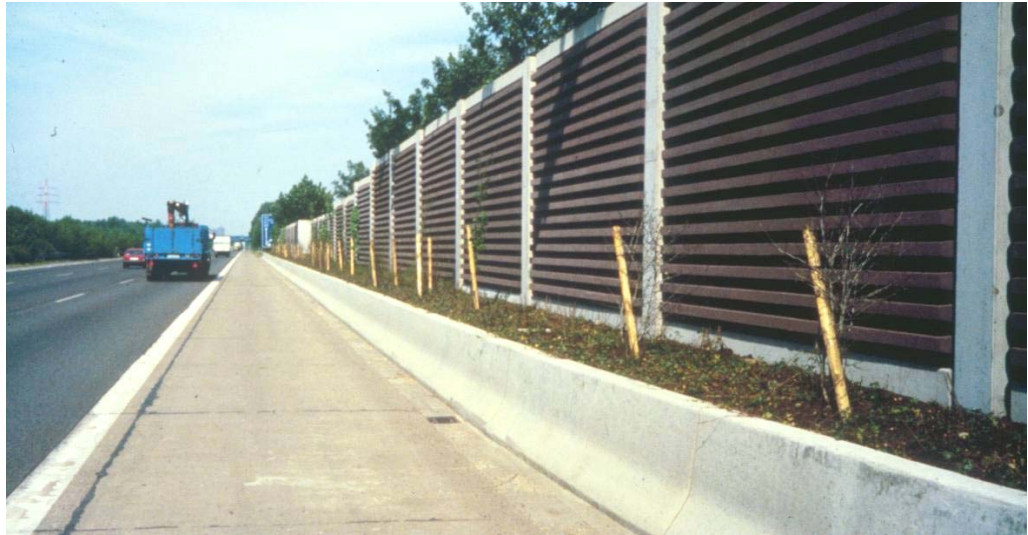
Figure 3.19. 4 m (13 ft) high brown profiled concrete noise barrier with 1 m high plant box with new vegetation in the front at Highway A4 in Germany [3].

Vegetation can also be used to break the monotony of long straight surfaces. If part of the barrier is formed as a plant box, this may make the barrier seem lower than it really is.