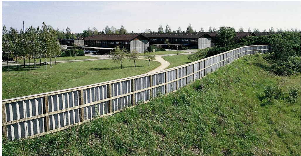
Figure 3.34. 1½ m high eternite (fiber cement) noise barrier with wooden frames on top of an earth embankment at Highway M10 in Greve vest of Copenhagen, Denmark. The barrier has steel net where plants can grow as times goes by [1].

It is necessary to give vegetation good growth conditions including access to sufficient water. At dry locations irrigating systems might be needed. Vegetation must have plenty of soil to grow in and while being protected from salt water from the winter maintenance of the road.