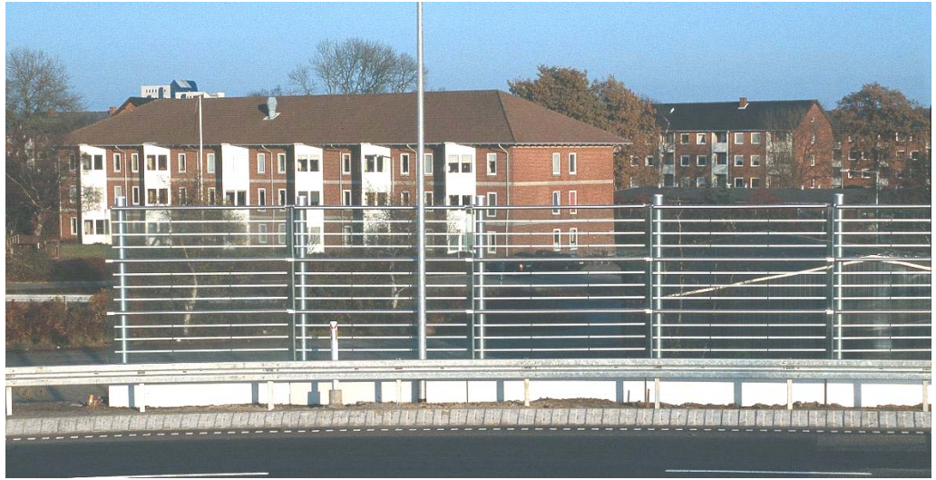
Figure 3.9. Transparent noise barrier along Danish highway in an urban area [2].