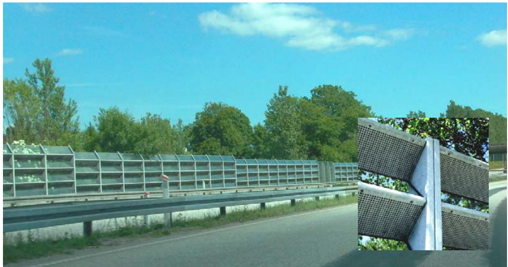
Figure 2.16. 3 to 4 m high transparent steel and glass barrier along Highway M11 near Fløng west of Copenhagen, Denmark [1]. The glass is placed at an angle of 45 ° to reflect the noise up in the air. The bottom sides of the steel elements are noise absorbing, see inserted photo to the right.