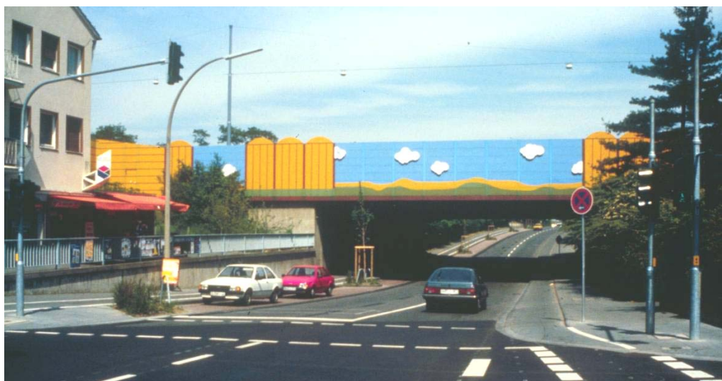
Figure 3.17. Noise barrier as a colorful urban element where Highway 555 in Germany passes on a bridge over a local road [3].