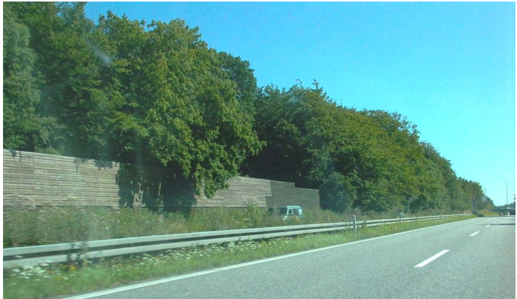
Figure 1.4. Brown wooden noise barrier adapted to the green surroundings on Highway M11 west of Roskilde, Denmark.

In connection with the planning and the design of noise screening structures, it is important that it should be adapted to the road and its surroundings. An increasing proportion of people's time is spent commuting on highways, and it is therefore an important task to make this time a positive experience, among other things, by seeking to ensure that roads pass through attractive surroundings.