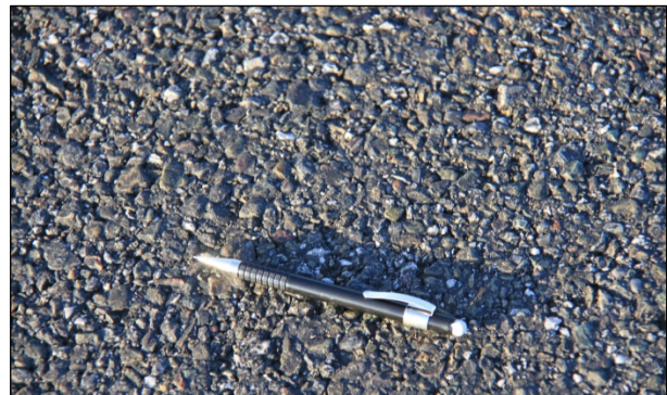
Figure 5.1: Orland Control, June 2009 (1 month).