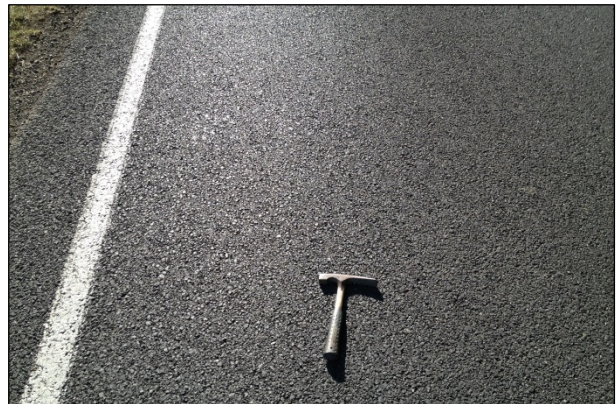
Figure 4.4: Point Arena Evotherm, December 2013 (54 months).