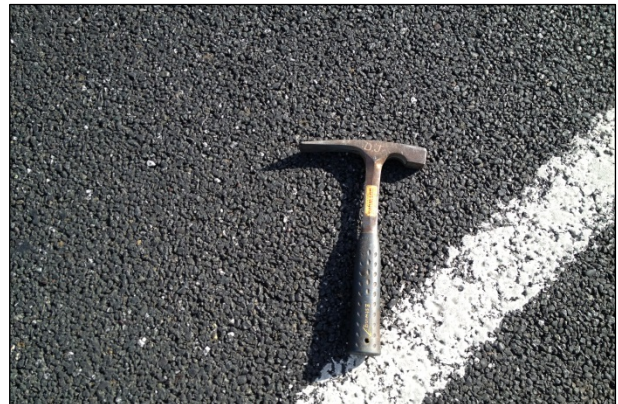
Figure 7.2: Mendocino Control, December 2013 (42 months).