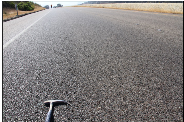
Figure 3.6: Morro Bay Advera, May 2012 (60 months), track marks no longer visible.