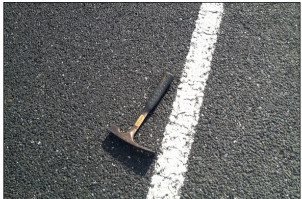
Figure 7.5: Mendocino Gencor, July 2010 (0 months).