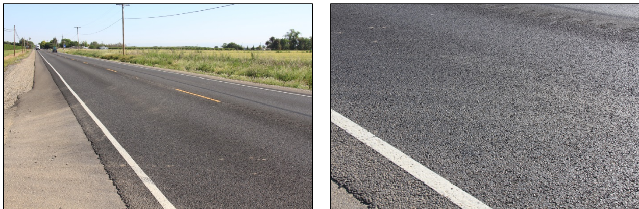
Figure 6.1: Marysville Evotherm, June 2009 (0 months).

No deterioration compared to the June 2009 baseline measurements was noted on the section after 24 months of traffic, indicating that frequent and aggressive turning movements by large agricultural equipment is unlikely to negatively influence warm-mix asphalt surfacings.