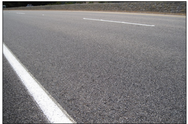
Figure 3.4: Morro Bay Control, June 2013 (73 months).