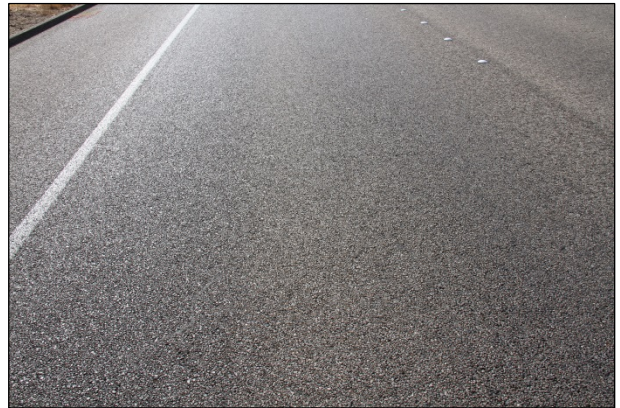
Figure 3.3: Morro Bay Control, May 2012 (60 months), track marks no longer visible.