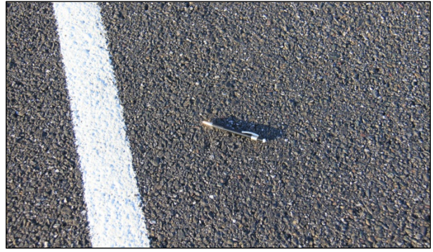
Figure 5.3: Orland Evotherm, June 2009 (1 month).