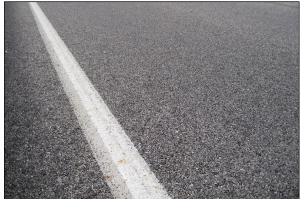
Figure 3.15: Morro Bay Sasobit, June 2013 (73 months).