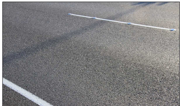
Figure 5.4: Orland Evotherm, June 2011 (24 months). Note ruts in wheelpath.