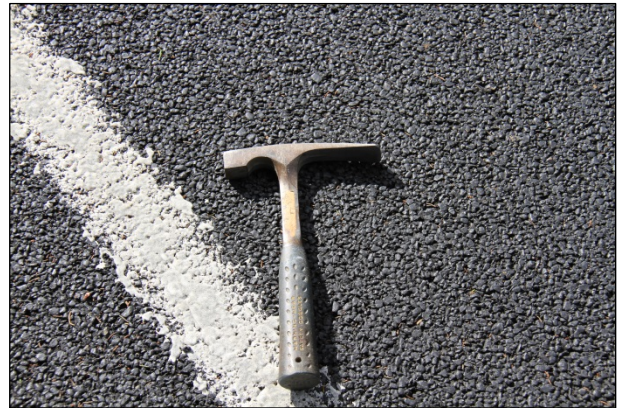
Figure 7.7: Mendocino Rediset, July 2010 (0 months).