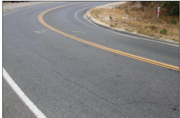
Figure 4.3: Point Arena Evotherm, November 2010, showing longitudinal cracks.