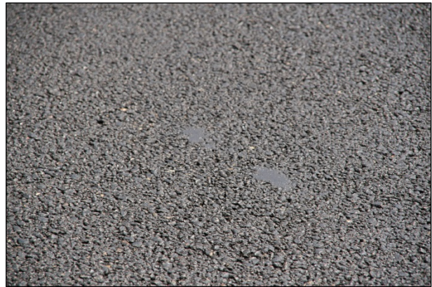
Figure 3.12: Morro Bay Sasobit, May 2007 (0 months).