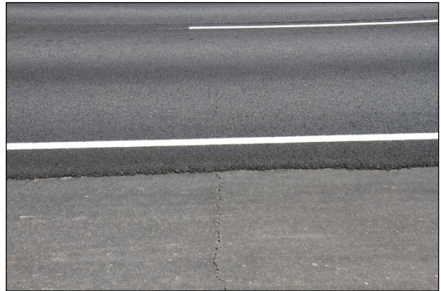
Figure 8.3: Auburn Evotherm, July 2012 (24 months). Note deterioration and reflected crack.