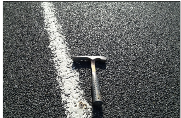
Figure 7.8: Mendocino Rediset, December 2013 (42 months).