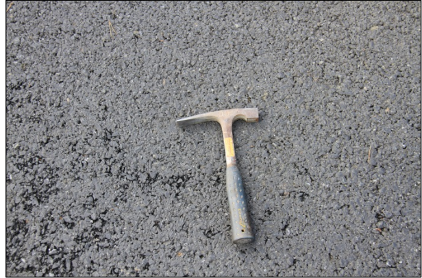
Figure 4.2: Point Arena Evotherm, November 2010 (23 months).