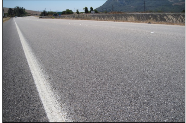
Figure 3.11: Morro Bay Evotherm, June 2013 (73 months).