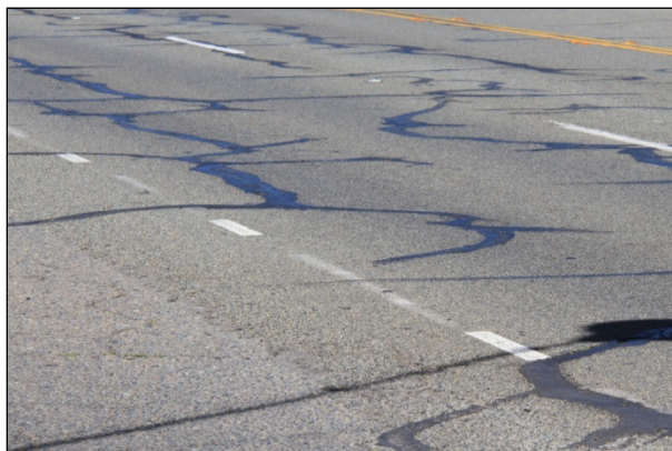
Figure 8.1: Auburn Evotherm, July 2010, one month prior to paving.

Reflected transverse cracking and some minor raveling in the outside wheelpath of the outside lanes was noted in some areas of the project. Given that no hot-mix control was available for comparison purposes, it was not clear whether these distresses were related to the warm-mix technology, to construction issues, or to other factors. No further deterioration compared to the August 2010 baseline measurements was noted.