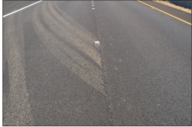
Figure 3.5: Morro Bay Advera, May 2007 (0 months).