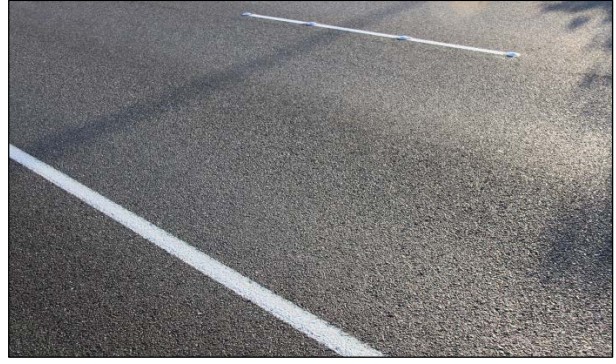
Figure 5.2: Orland Control, June 2011 (24 months). Note ruts in wheelpath.