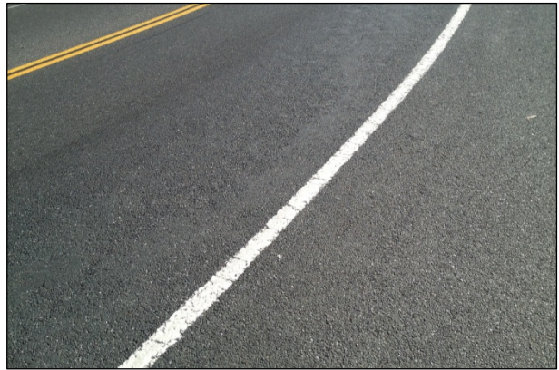
Figure 7.4: Mendocino Advera, December 2013 (42 months). Note raveling in outside wheel path.