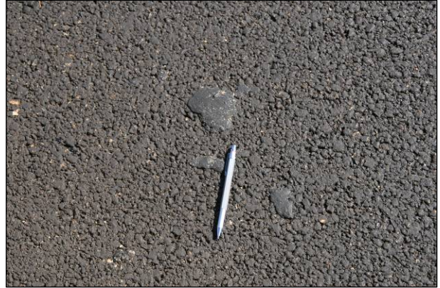
Figure 3.8: Morro Bay Evotherm, May 2007 (0 months).