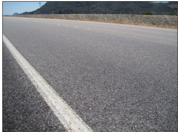
Figure 3.7: Morro Bay Advera, June 2013 (73 months).