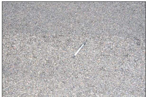
Figure 3.13: Morro Bay Sasobit, May 2007 (0 months), track marks.