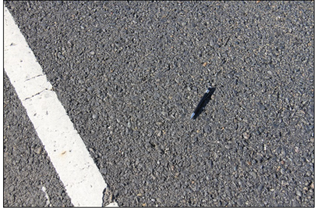
Figure 6.2: Marysville Evotherm, June 2011 (24 months).