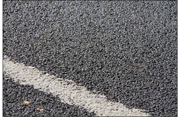
Figure 7.6: Mendocino Gencor, December 2013 (42 months).