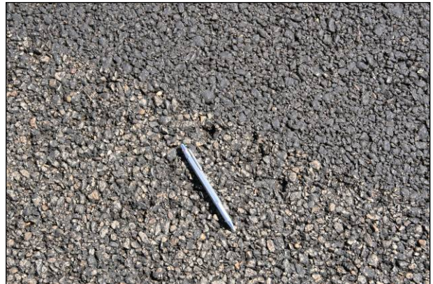
Figure 3.9: Morro Bay Evotherm, May 2007 (0 months), track marks.