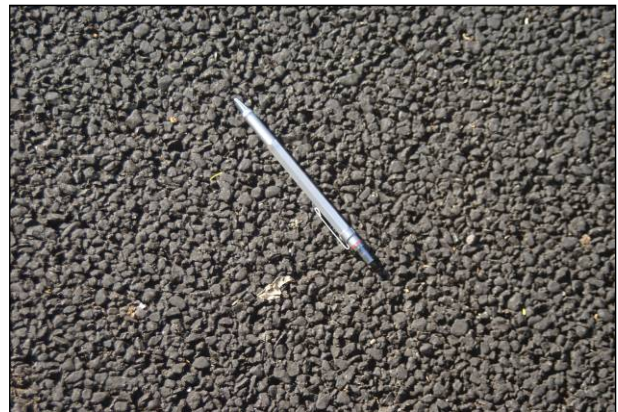
Figure 7.1: Mendocino Control, July 2010 (0 months).