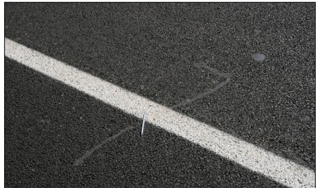
Figure 3.1: Morro Bay Control, May 2007 (0 months).