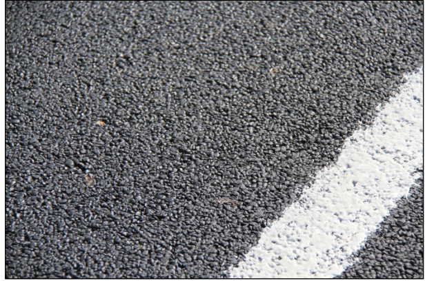
Figure 7.3: Mendocino Advera, July 2010 (0 months).