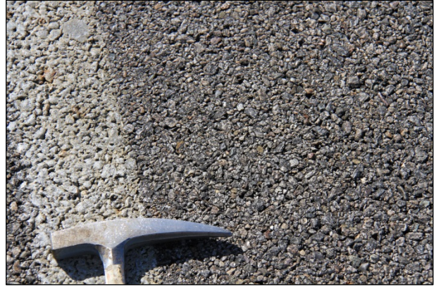
Figure 3.14: Morro Bay Sasobit, May 2012 (60 months), track marks no longer visible.