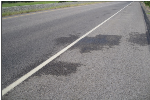
Figure 3.16: Morro Bay Sasobit, June 2013 (73 months), showing effective drainage.