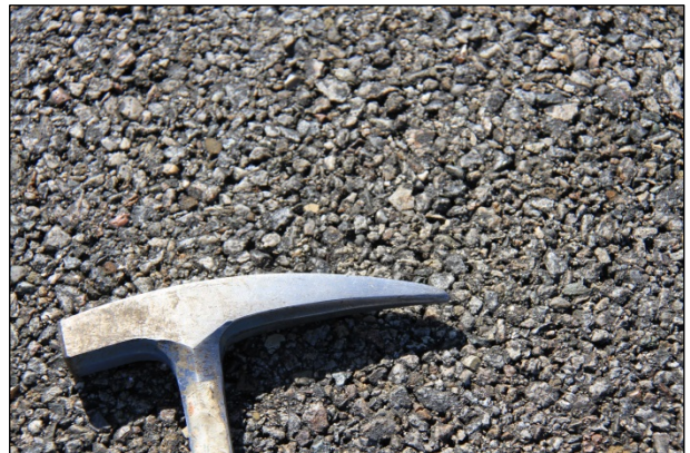
Figure 3.10: Morro Bay Evotherm, May 2012 (60 months), track marks no longer visible.