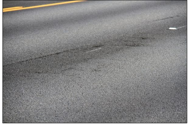
Figure 8.2: Auburn Evotherm, August 2010 (0 months). Note segregation and open joint.