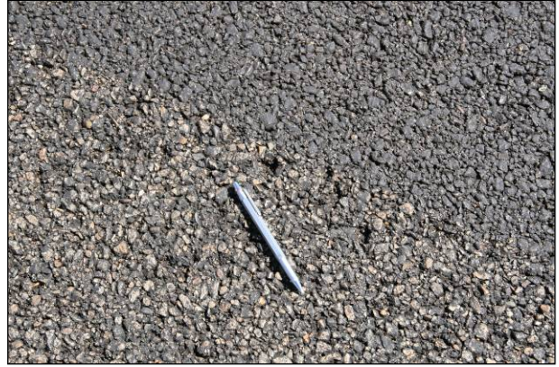
Figure 3.2: Morro Bay Control, May 2007 (0 months), track marks.