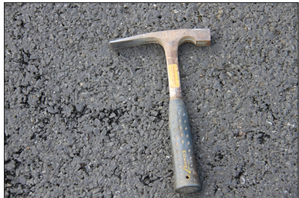
Figure 4.1: Point Arena Evotherm, December 2008 (3 months).