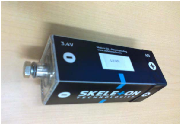
Fig.1. Photograph of the 3200F Skeleton Technologies device

The Yunasko 5000F hybrid device (Figure 3) utilizes carbon and a metal oxide in both electrodes. Different metal oxides are used in the two electrodes and the percentages of the metal oxides are relatively small. Test results for the device are given in Table 3. The voltage range of the device is 2.7 - 1.35V. The energy density is 30 Wh/kg for constant power discharges up to 4 kW/kg. The device has a low resistance and consequently, a high power capability of 3.1 kW/kg, 6.1 kW/L for 95% efficient pulses.