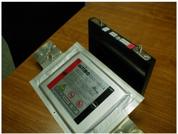
Fig.2. Photographs of the JSR Micro 1100F and 2300F devices