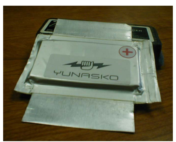
Fig.3. Photograph of the 5000F Yunasko hybrid Supercapacitor device