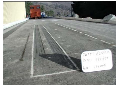
HVS test section