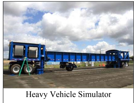
Heavy Vehicle Simulator

This phase of the study, which investigated rutting performance on conventional dense-graded asphalt concrete, was based on a workplan approved by Caltrans and included the design and construction of a test track and accelerated load testing using a Heavy Vehicle Simulator (HVS) to assess rutting behavior. A series of laboratory tests on specimens sampled from the test track to assess rutting and fatigue-cracking performance and moisture sensitivity were also undertaken; those results are discussed in Chapter 4.