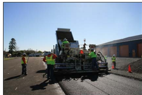
Test track construction