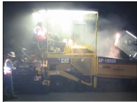
Hot mix asphalt

Warm mix asphalt (WMA) is a relatively new technology. It was developed in response to demands for reduced energy consumption and stack emissions during the production of asphalt concrete, for better performance after long hauls, lower placement temperatures, improved workability, and better working conditions for plant and paving crews. Studies performed in the United States and in Europe indicate that significant reductions in production and placement temperatures and of potentially related emissions are possible. However, concerns exist about how these lower production and placement temperatures might influence asphalt binder aging and, consequently, both short- and long-term performance, specifically rutting.