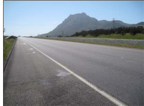
Morro Bay field experiment

Based on the observations in this study, the use of warm mix technologies in open-graded friction course mixes with polymer- and asphalt rubber binders appears to be beneficial, especially on projects that require long hauls and/or placement in cold temperatures. The use of warm mix technologies resulted in improved workability of the mix and better compaction, which should improve durability and prevent early raveling.