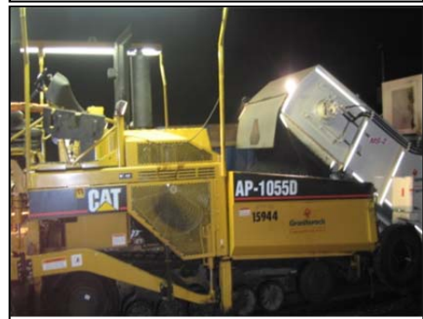
Warm mix asphalt

The California Department of Transportation (Caltrans) expressed interest in warm mix asphalt with a view to reducing stack emissions at plants, to allow longer haul distances between asphalt plants and construction projects, to improve construction quality (especially during nighttime closures), to improve working conditions during construction, and to extend the annual period for paving. However, the use of warm mix asphalt technologies requires incorporating an additive into the mix, and/or changes in production and construction procedures, specifically related to temperature, which could influence both the short- and long-term performance of the pavement, as well as emissions during production and placement. Consequently, the need for research was identified by Caltrans to address a range of concerns related to these changes before statewide implementation of the technology is approved.