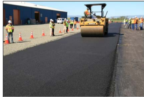
Test track compaction