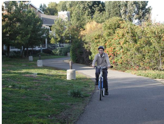
FIGURE 2 Bicycle rider in Pleasant Hill.

An evaluation of the use of the three devices is expected to contribute significantly to an understanding of the context in which the different low-speed devices may increase transit ridership.