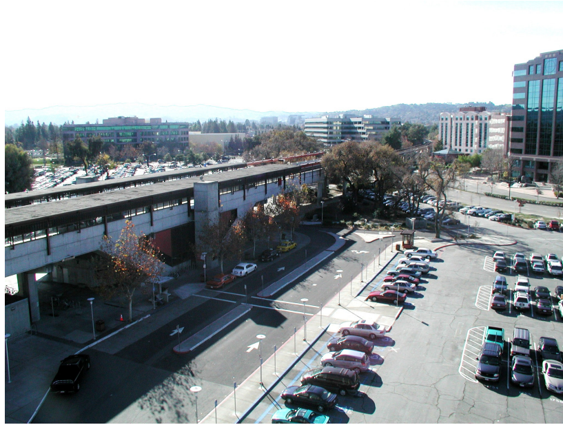
FIGURE 1 Current site conditions, Pleasant Hill BART station.