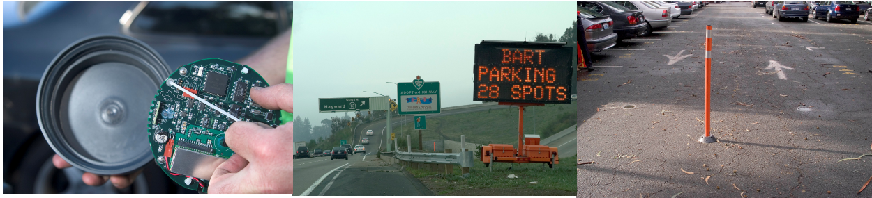
FIGURE 4 Images of smart parking field operational test.