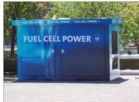
FIGURES 5 Hydrogen Fuel Cell Components, reproduced from (12).